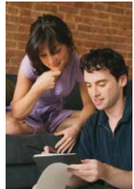
Figure out what you owe.

The good thing about the new year is that it gives everyone the chance to start over. That being said, you can make a new year's resolution to improve your financial situation. Here are some tips to accomplish just that.